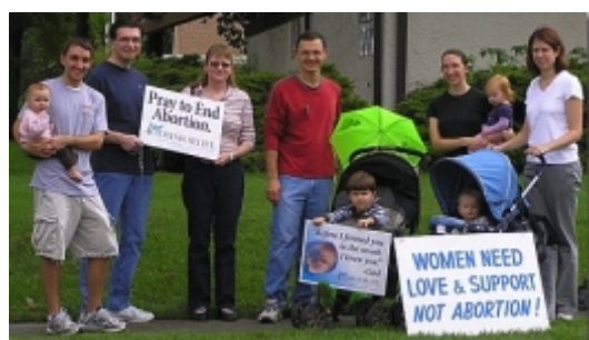
MISSION & OUTREACH

Fri.-Sat., November 18-19 at the new All Saints' Church, Woodbridge, Va. Annual Synod reconvenes with a focus on mission, featuring a testimony by each church and fellowship about what the Lord is doing through you.