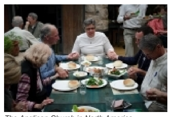
The Anglican Church in North America Presents

The Second Annual Pilgrimage to the Holy Land and Biblical Jordan